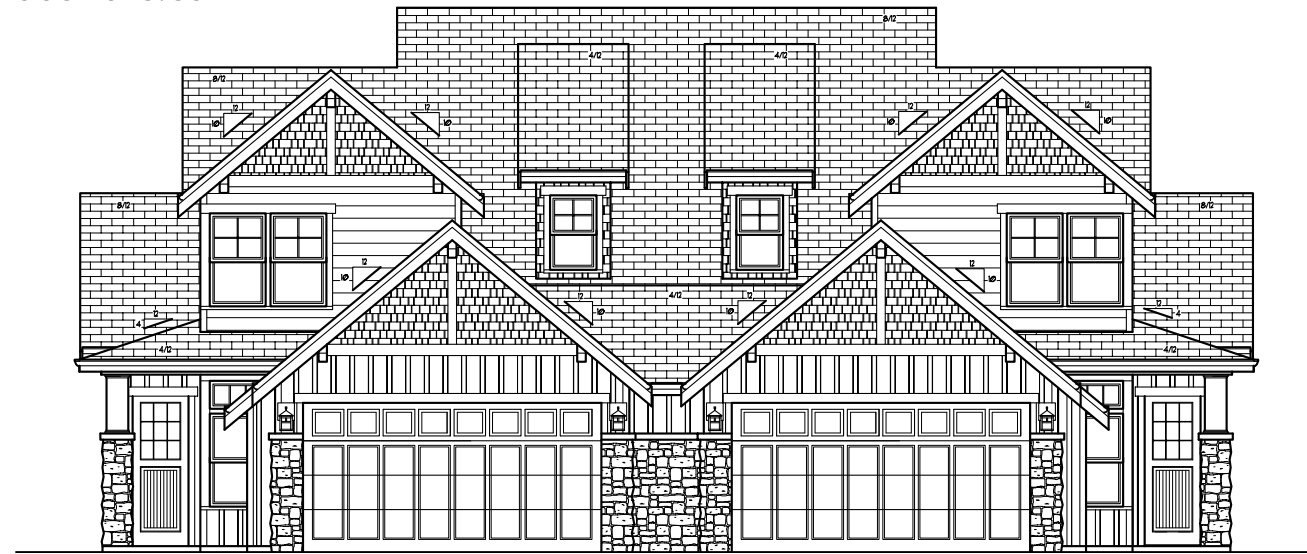
STREET SIDE 9434 Turnstone Ln.