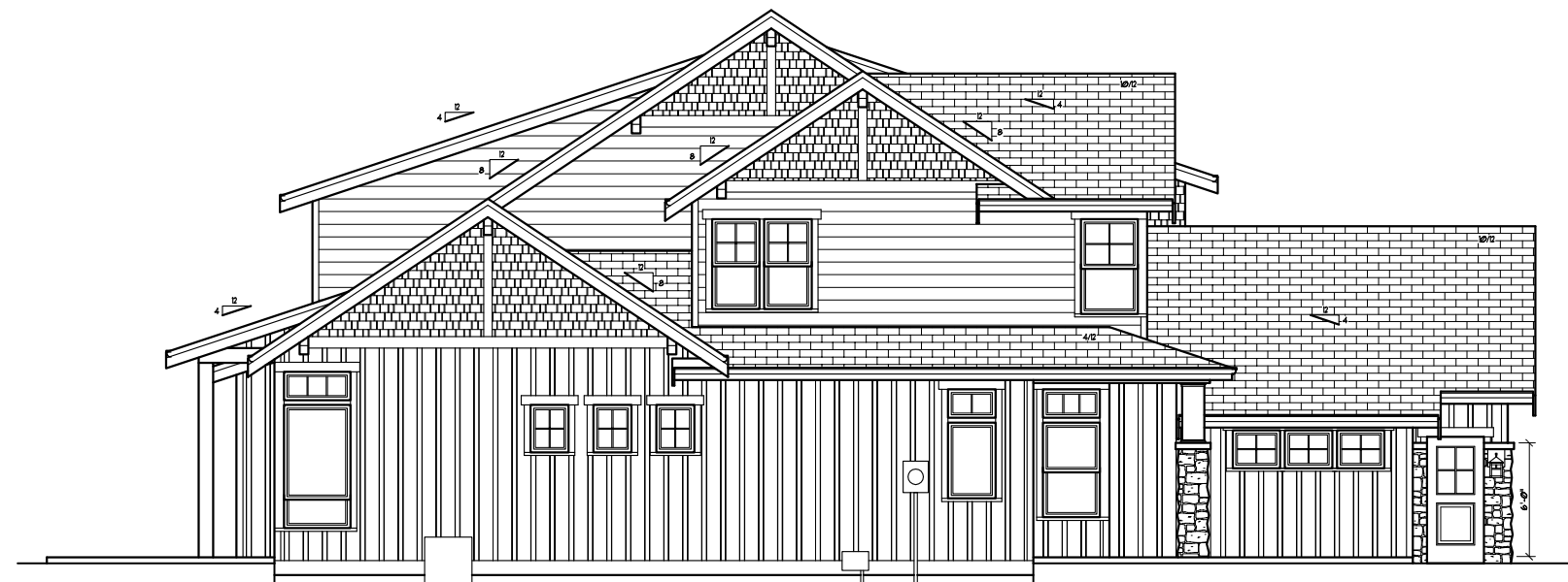
SIDEVIEW 9420 Turnstone Ln.

*Prices subject to change. While every effort has been made to ensure the accuracy of this document, we are not responsible for any errors or omissions. Please verify all final information with your realtor.