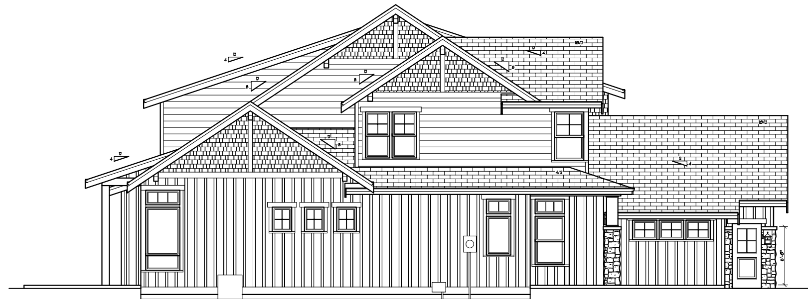
SIDEVIEW 9434 Turnstone Ln.

*Prices subject to change. While every effort has been made to ensure the accuracy of this document, we are not responsible for any errors or omissions. Please verify all final information with your realtor.