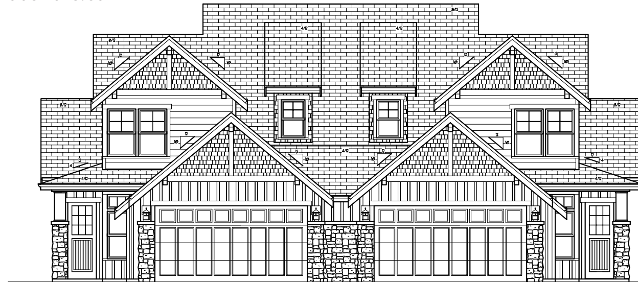
STREET SIDE 9420 Turnstone Ln.