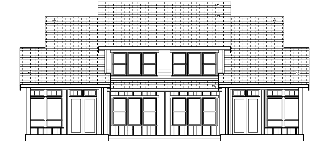
WATERSIDE 9422 Turnstone Ln.