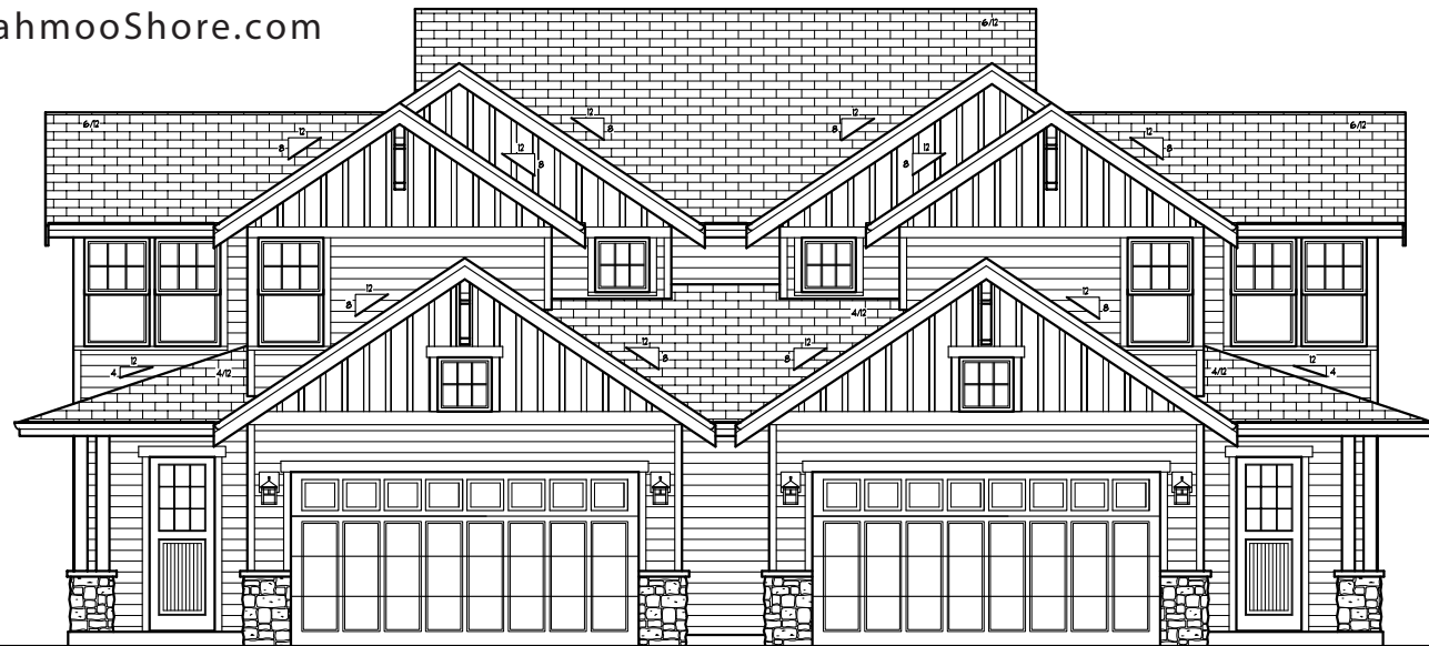
STREET SIDE 9422 Turnstone Ln.