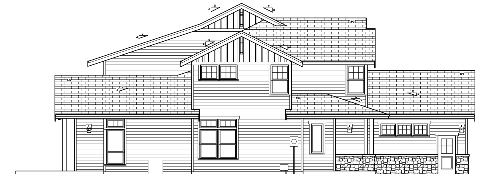
SIDEVIEW 9422 Turnstone Ln.

Model Open Daily noon to 5 PM • (360) 527-8901