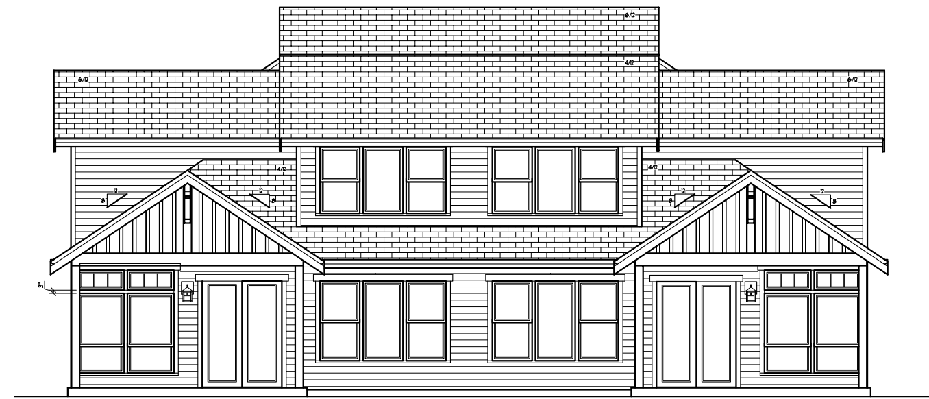
WATERSIDE 9420 Turnstone Ln.