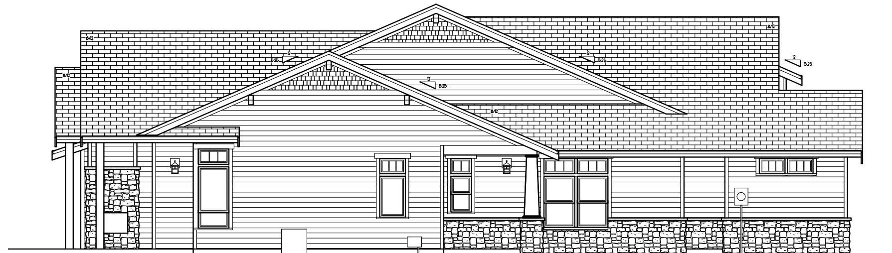
SIDEVIEW 9408 Turnstone Ln.

Den/Office: No Bonus Room/Loft: No Upper Balcony: No Fireplaces: 2 2-Car Garage: Yes