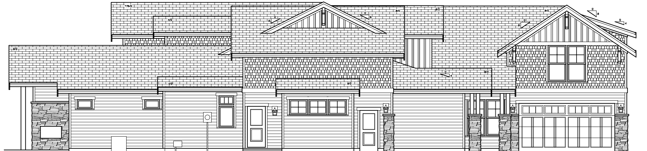
SIDEVIEW 9404 Turnstone Ln.