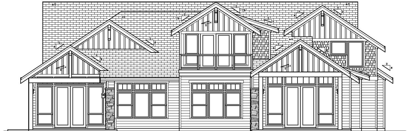
WATERSIDE 9402 Turnstone Ln.