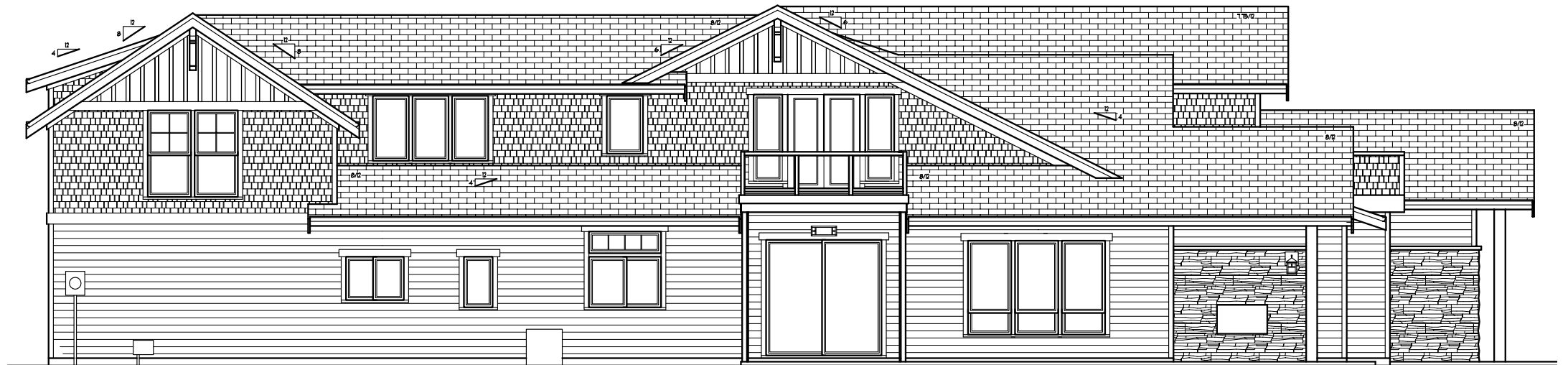
SIDEVIEW 9402 Turnstone Ln.