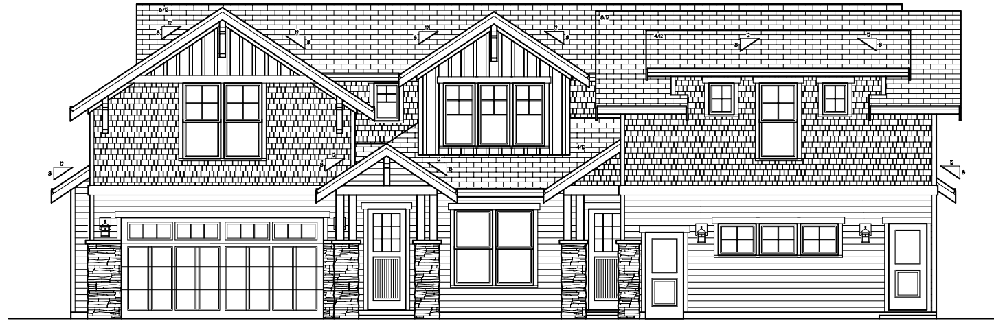
STREET SIDE 9404 Turnstone Ln.