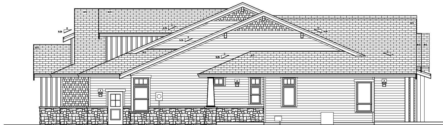
SIDEVIEW 9405 Turnstone Ln.