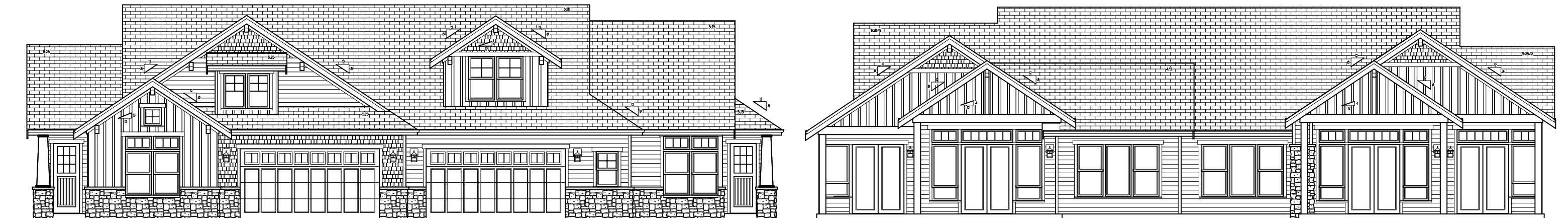
STREET SIDE 9405 Turnstone Ln.