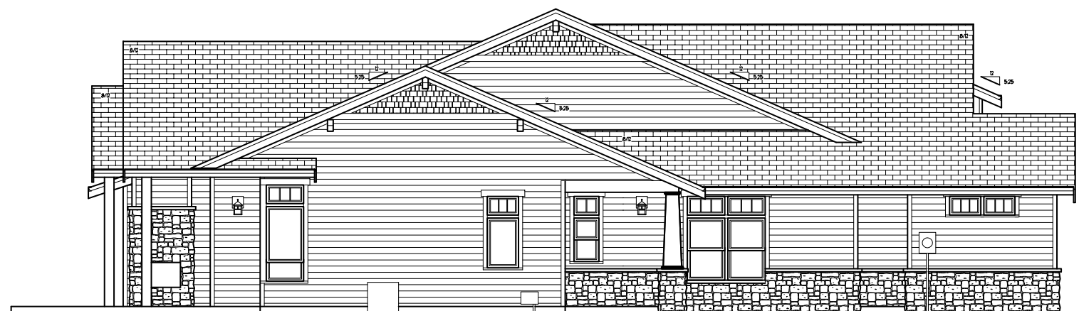
SIDEVIEW 9407 Turnstone Ln.

*Prices subject to change. While every effort has been made to ensure the accuracy of this document, we are not responsible for any errors or omissions. Please verify all final information with your realtor.