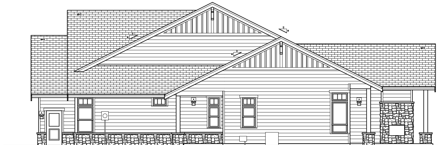
SIDEVIEW 9411 Turnstone Ln.

*Prices subject to change. While every effort has been made to ensure the accuracy of this document, we are not responsible for any errors or omissions. Please verify all final information with your realtor.