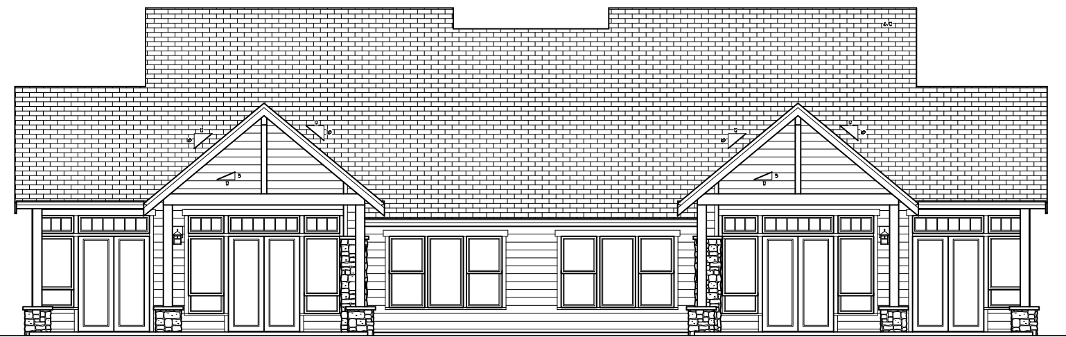
WATERSIDE 9411 Turnstone Ln.