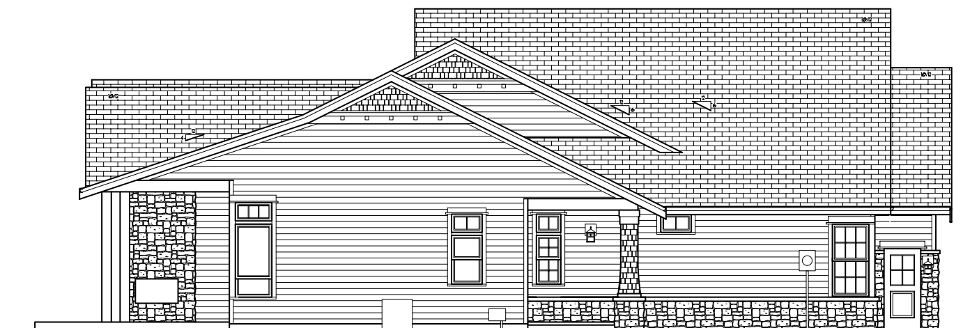
SIDEVIEW 9413 Turnstone Ln.

*Prices subject to change. While every effort has been made to ensure the accuracy of this document, we are not responsible for any errors or omissions. Please verify all final information with your realtor.