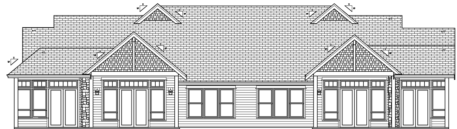
WATERSIDE 9415 Turnstone Ln.