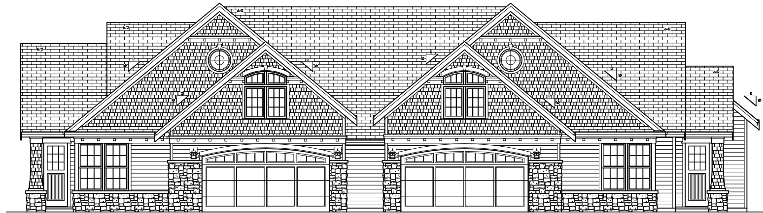
STREET SIDE 9413 Turnstone Ln.