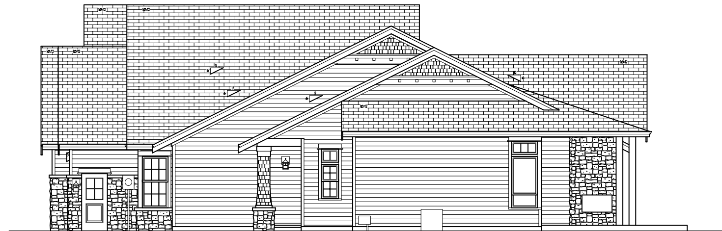
SIDEVIEW 9415 Turnstone Ln.

*Prices subject to change. While every effort has been made to ensure the accuracy of this document, we are not responsible for any errors or omissions. Please verify all final information with your realtor.