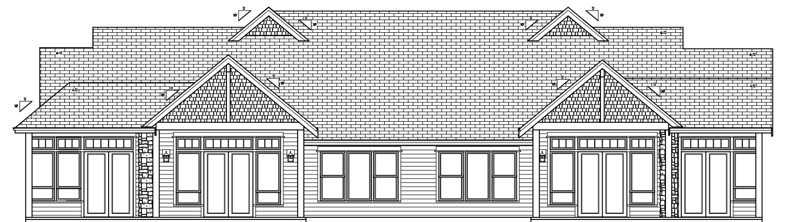
WATERSIDE 9415 Turnstone Ln.